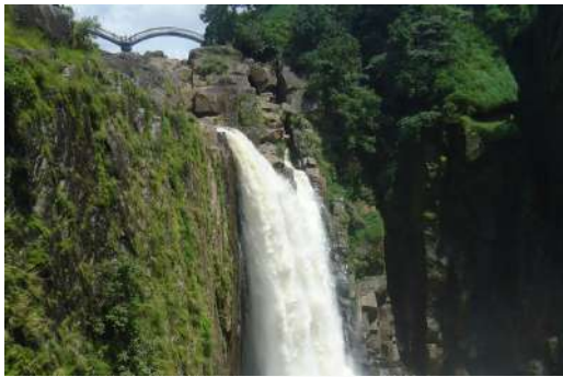
Cherrapunji, Meghalaya 793108