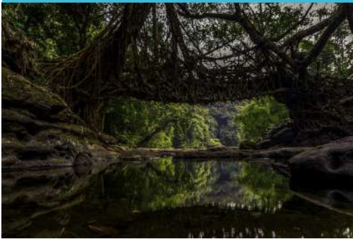
7M2C+Q95, Nongriat, Meghalaya 793111; Hours: Closes 5 pm