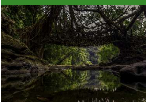
Located at Mawlynnong Nohwet Village