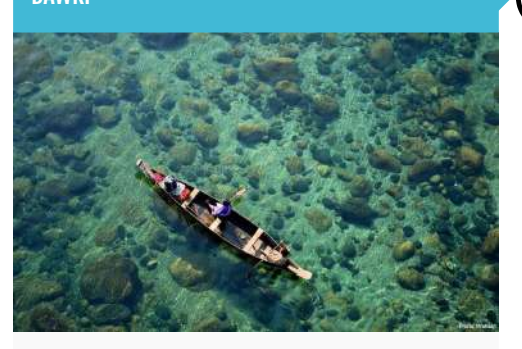
Activities at Dawki: Boating at Umngot river / Snorkeling/ Fishing/ Swimming/ Camping at Dawki or one