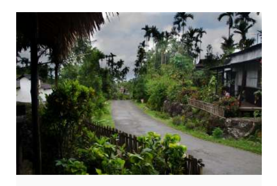
Located at Mawlynnong